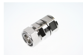
OMNI FIT™ Standard Connectors